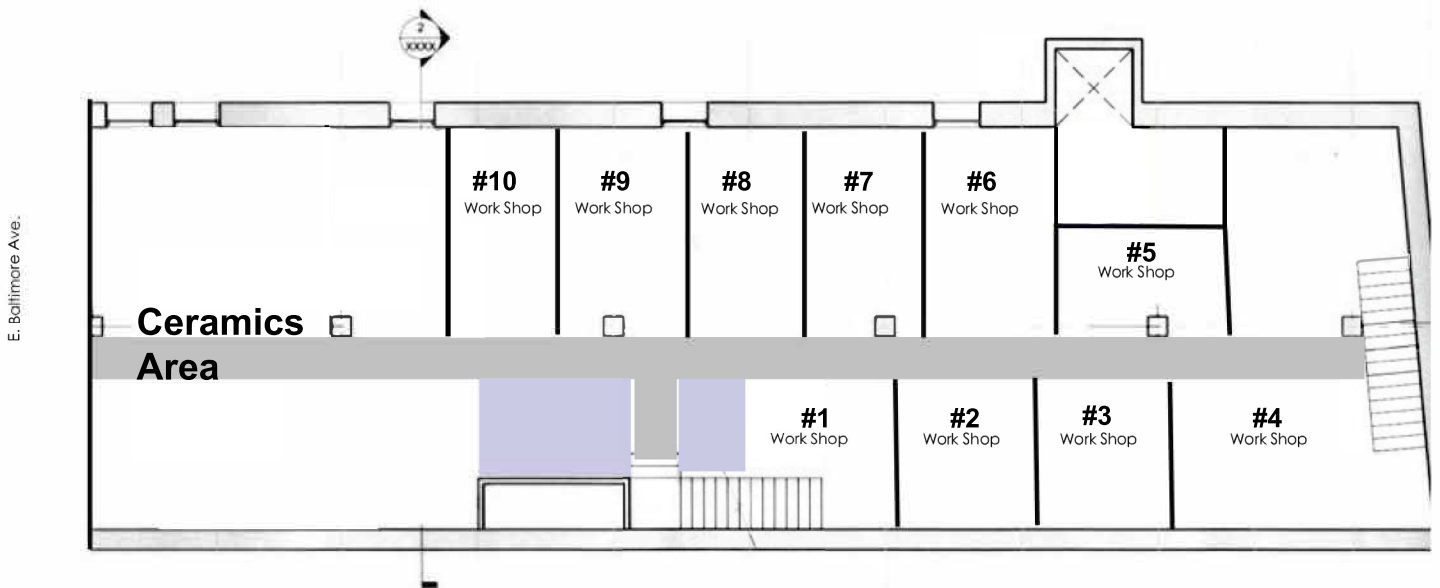
Utility Works - Basement Floor Plans 32 East Baltimore Ave., Lansdowne, PA Not to scale - for informational purposes only